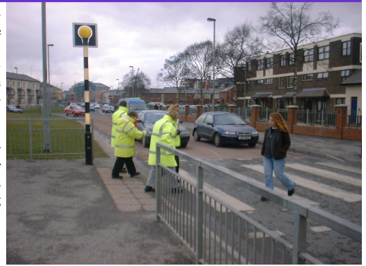
Clients undertaking a practical training session

The programme is a practically based training resource and therefore assessment of clients is undertaken using practical sessions from a 'can do' rather than a 'know how to do' perspective.